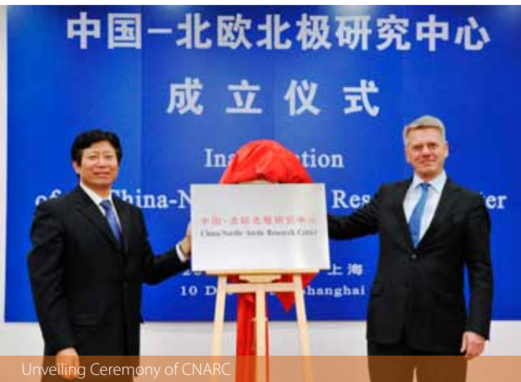
Unveiling Ceremony of CNARC