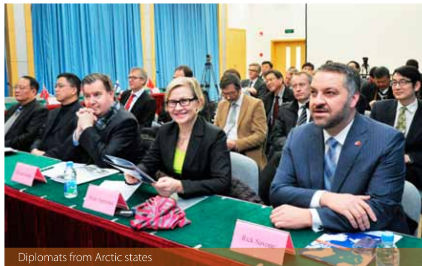
Diplomats from Arctic states