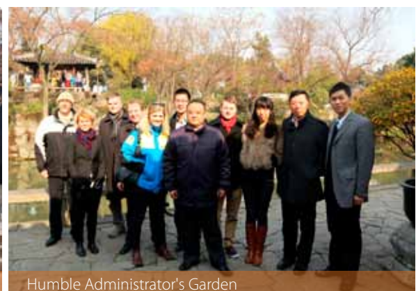
Humble Administrator's Garden