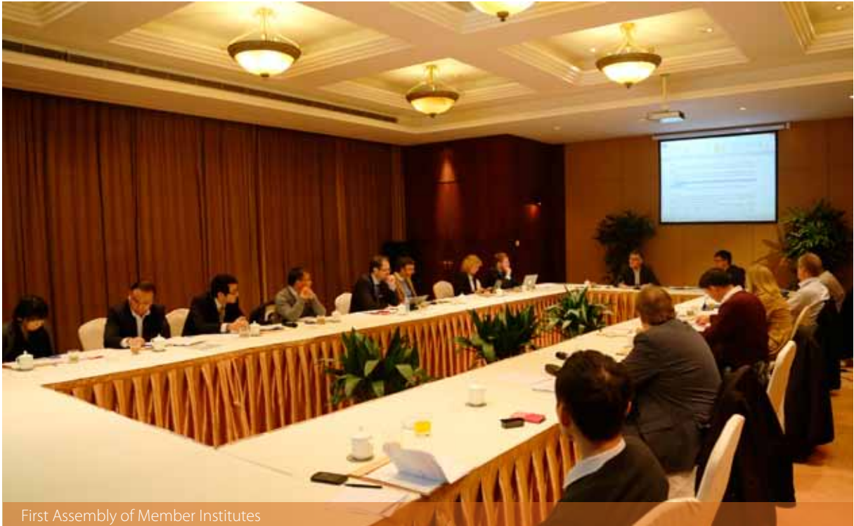
First Assembly of Member Institutes