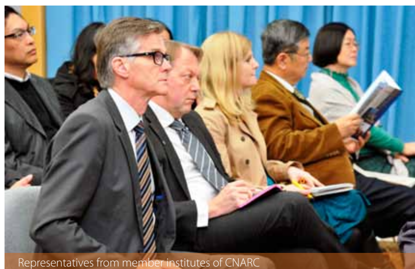
Representatives from member institutes of CNARC